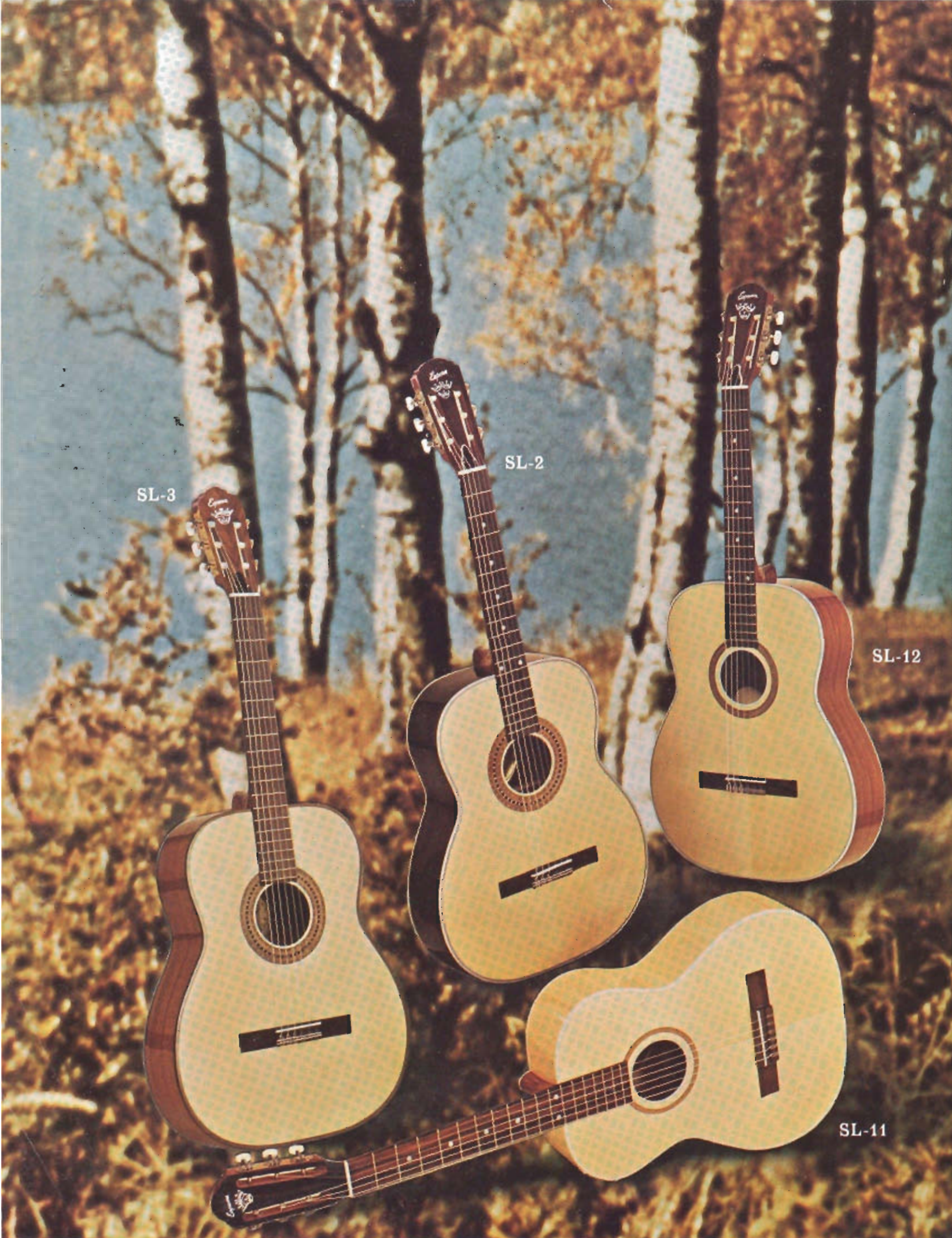
Scenic Views: Finland, where excellence in wood craftsmanship is the tradition of centuries.