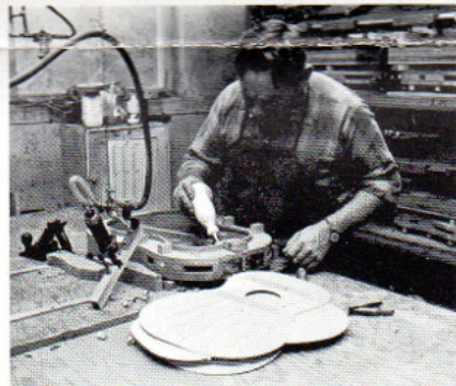
Top and bottom are glued to the side.