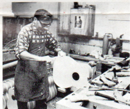
The body of a guitar gets its' final polish before the lacquering process.