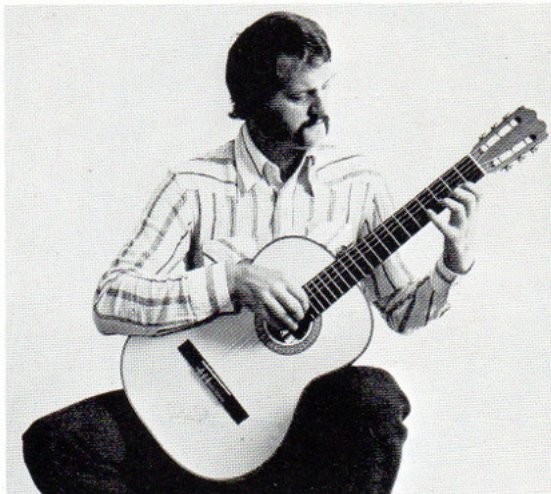
A specially trained musician tests all the instruments before they leave the factory.

That special touch which a craftsman gives to Hagström guitars shows Swedish handi-craft at its best!