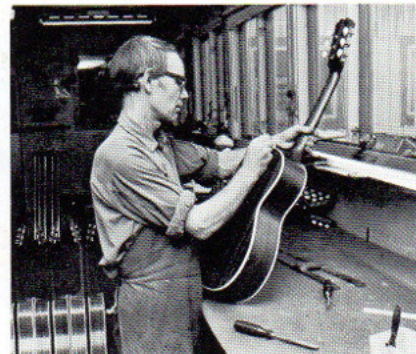
Alignment of the neck is one of the most important details of manufacturing.