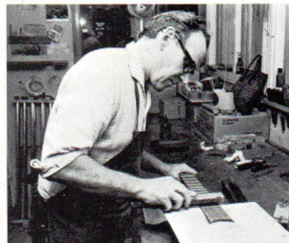
The fingerboard is carefully adjusted before final mounting.